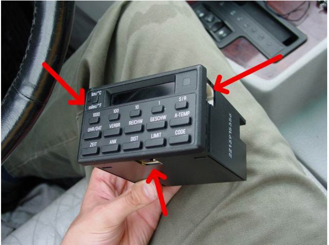
Ofcourse you can't reach then with your hands that would be to easy. So use a set of pliers to turn the bulbs out of the OBC: