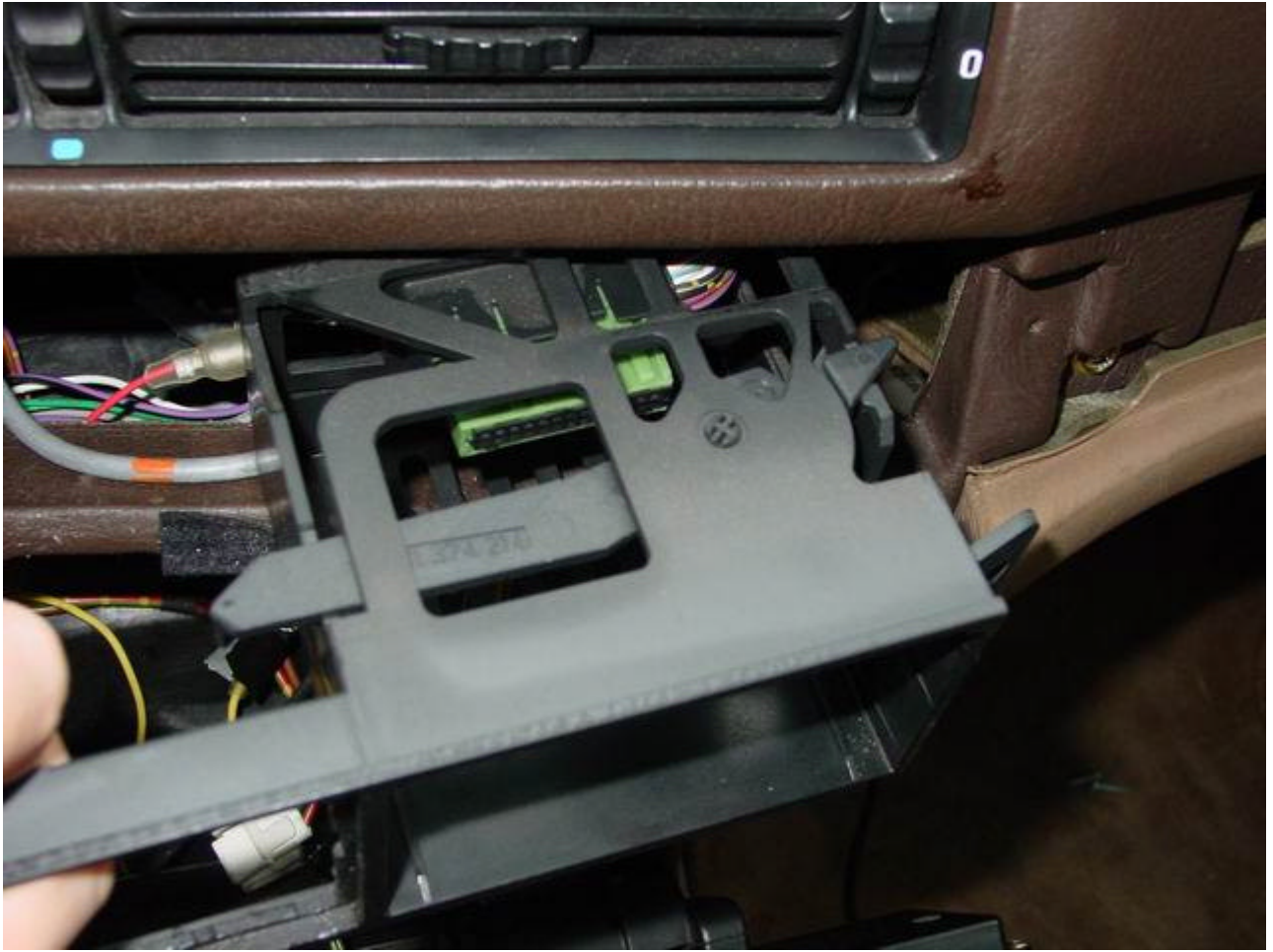
The OBC IV will have three 12v 1.2 watt bulbs that are located here: